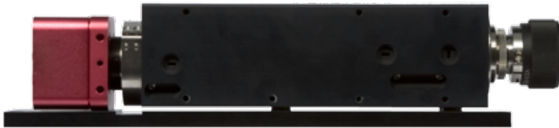
ImSpector Fast10 combined with fore lens and camera

More information about fiber optics can be found from Multipoint spectrometers -data sheet.