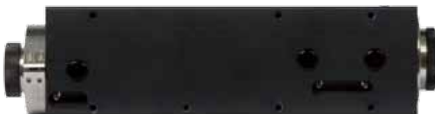
ImSpector Fast10, side view

*1 System spectral and spatial resolutions also depend on the discrete imaging nature of detector and lens quality.