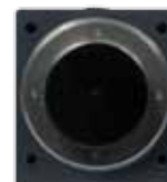
ImSpector Fast10, front view