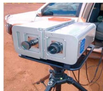
Dual VNIR and SWIR camera setup on a rotary scanner

Scanning of human body and other biological targets