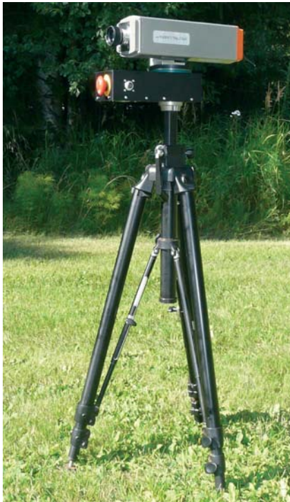
Rotating Scanner mounted on a cased Spectral Camera on top of a standard tripod