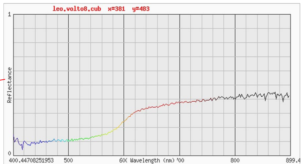
Reflectance spectrum from hyper-spectral image cube