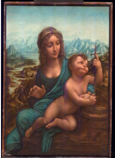
Madonna of the Yarnwinder