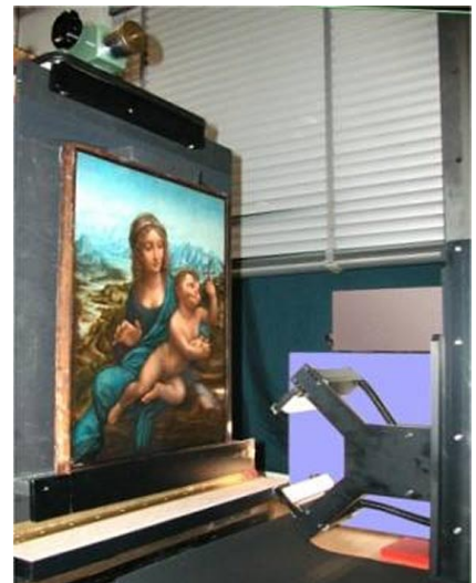
Figure. 2 - Scanning a painting on a wooden panel