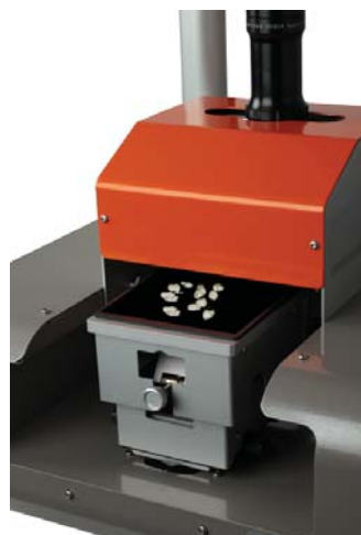
Picture 2. A sample tray holding cheese granules has been loaded into sisuCHEMA, here fitted with a macro lens, which images the samples at 30 micron resolution.