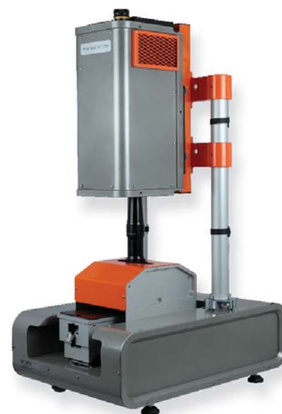
Picture 1. SisuCHEMA imaging workstation

SisuCHEMA comes with various sample trays that can be loaded into the instrument while containing dairy samples (picture 2). SisuCHEMA's push-broom technology along with all its advantages provides a rapid measuring procedure, a pre-requisite for keeping the often moist and fresh dairy samples unimpaired. The recorded hyperspectral images are then easily transferred to the analysis software Evince, where chemical composition and its distribution can be analyzed and viewed with various types of visualizations (picture 3).