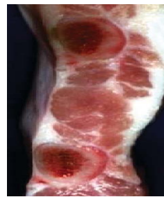
Pork meat analysis